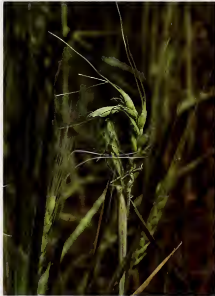
Wheat leaves in a plant attacked by the Russian wheat aphid tend to roll, trapping the developing grain head. When the grain head cannot mature properly, yield and quality are adversely affected.

approximately $221 million, and an additional $55 million was expended for control. During the 1989–90 growing season, infestations were not as widespread as in previous years, but yield losses still totaled over $33 million. Control costs amounted to just over $15 million, and the pest exerted an estimated indirect impact on the community of over $44 million. These monetary losses, as well as possible environmental and social costs, may increase and will continue to accumulate if more effective and environmentally appropriate control measures are not developed.